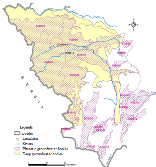
Figure 2 Demarcation of groundwater bodies [5]

In Banat catchment area were identified, defined and described a total of 20 groundwater bodies, five of them are transboundary ground water bodies (figure 2) [5].