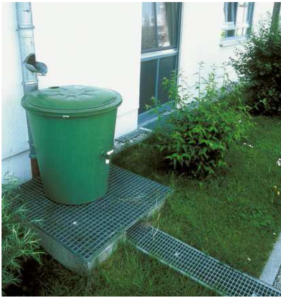
Figure 1 Plastic container placed over a gutter covered with grill

Washing machine. This possibility exists and is exploited in many European countries, selling tanks to capture and water clarification. Rainwater has the advantage that is a water of a very low hardness good for washing. Low hardness water also prolongs the life of the machine, with very small deposits. It should be noted that through method of collecting and because atmospheric dust rainwater contains organic and mineral impurities.