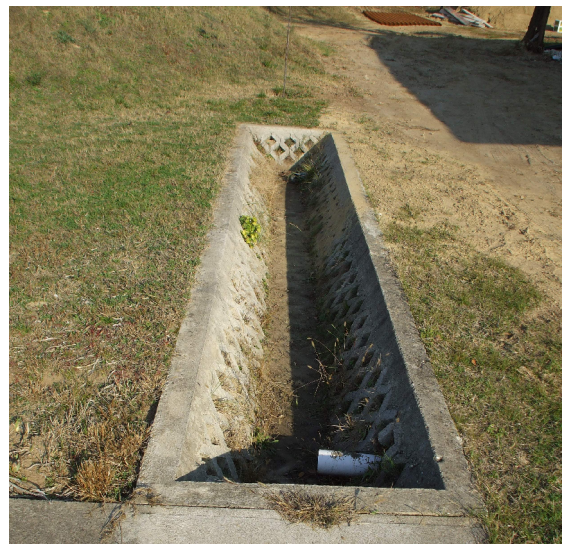
Figure 3 Gutter for rainwater infiltration into the soil, made of perforated tiles

Solutions to storm water infiltration into the soil and groundwater enrichment are multiple. Their presentation goes beyond the paper. A simple infiltration rain gutter is shown in Figure 3: