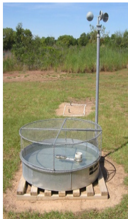
Fig.3 Evaporation pan

With Pan evaporation we can measure daily evaporation. The best known of the pans are the "Class A" evaporation pan (fig.3) and the "Sunken Colorado Pan". Knowing daily evaporation we can calculate reference crop evapotranspiration with Doorenbos & Pruitt 1974 formula (S. Mohan 1991):