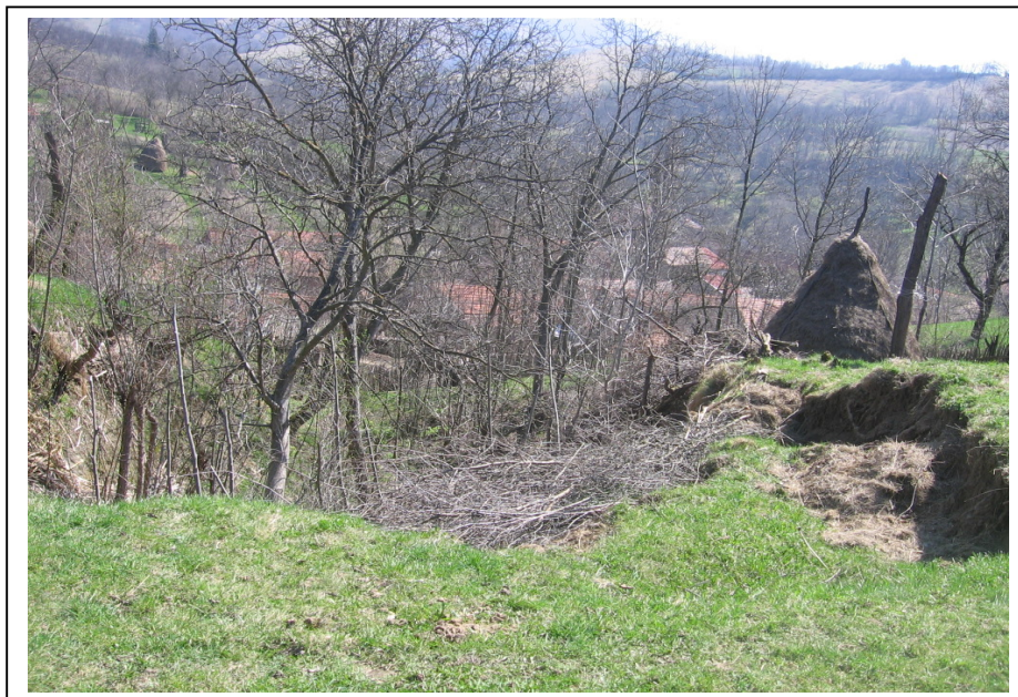
Fig. 2 The Cernilova land slip