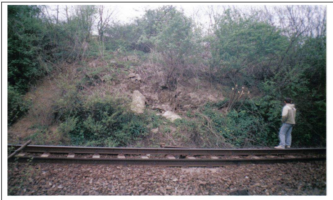
Fig. 4 The land slip near the rail road.

• To stop the erosion from the peak of the ravine that are situated near the water supply basin we propose: