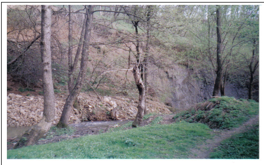
Fig. 3 The Cucuiului Hill land slip