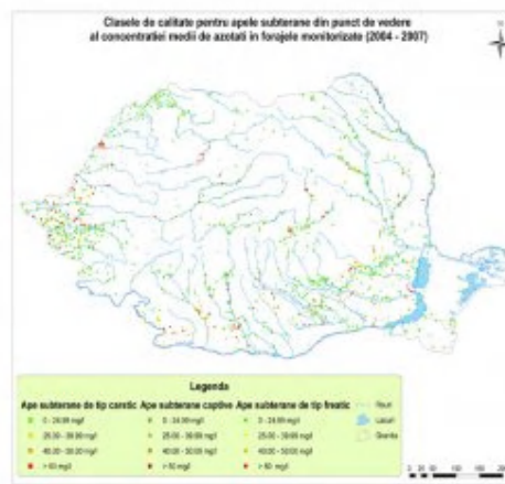
Fig 1. Groundwater quality classes in terms of nitrogen concentration

The two major sources, with significant weight in nitrogen pollution of groundwater by continuous washing soil impregnated with nitrogen oxides from rainfall and irrigation water and surface water (rivers, lakes) in which wastewater was discharged loaded with nitrogen.