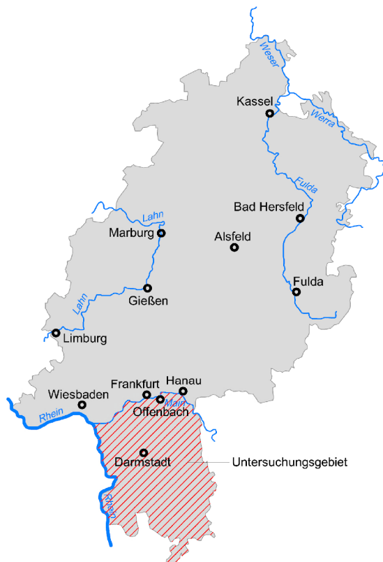
fig.1: Area of investigation

The data set used in this investigation was derived from the global climate model ECHAM 5 in conjunction with the scenario simulations by the IPCC. For the scenario simulation A1B regional models based on statistical methods like the WETTREG-2006- (CEC Potsdam) and STAR 2-(PIK) data sets have been drawn upon as well as the dynamic climate model CLM. For the CLM data set the precipitation has been subjected to a bias-correction. The time series used for this investigation covers the years 1961 to 2100.