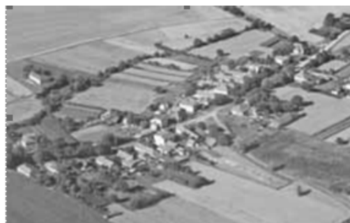
Figure 1. An example of extending the space of a locality

An example of extending the space of a locality in compliance with the rules so as not to produce too great negative effects is presented in the figure below (Figure 1).