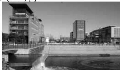
Figure 2. The apartments built on a disused industrial site

In Helsinki a development project was developed and a residential neighborhood was built that is in accordance with the highest ecological standards and the highest level. It was built to meet the housing needs of the people in that area. This project has shown that new living standards can be successfully developed even with minimal impact on the environment. The average built-up area per capita that has become waterproof is much lower compared to standard homes. Homes have been equipped with alternative energy sources, so the average energy consumption per home is low.