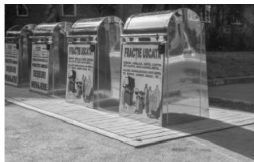
Figure 1. Organic islands for waste disposal in Brasov

Waste management through underground infrastructure is, of course, an important development that allows efficient and cost-effective approach to some of the most important needs of modern society. This paper aims to present the solutions provided by such an infrastructure, to identify the operational characteristics and the benefits of this collection method, as well as to provide information on the costs of these works compared to the costs of traditional waste collection systems. The lifetime of these waste collectors is important compared to the traditional life of the waste collectors. They have a much shorter operating time. Those presented in the paper will highlight future issues in order to analyse, present and increase the efficiency of the underground system for waste collection and recycling.