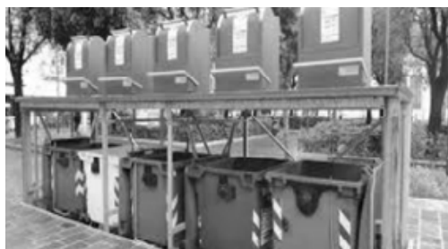
Figure 2. Waste disposal platforms in Brasov