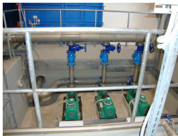
Figure 2. Treatment Plant proposed - influent pumps / wash filters

The filters are washed in counter current with filtered water and compressed air, water caring the deposition of the granules of coal, and compressed air contribute to the blowing and washing the granules of coal. GAC filters are washed alternately with sand filters.