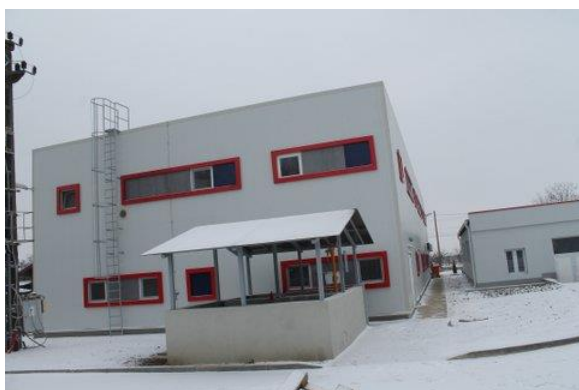
Figure 6. Treatment Plant Building

Treatment Station building is a new construction, made from a metal structure with pillars profiles, beams (frames) and closed with sandwich panels (Figure 6).