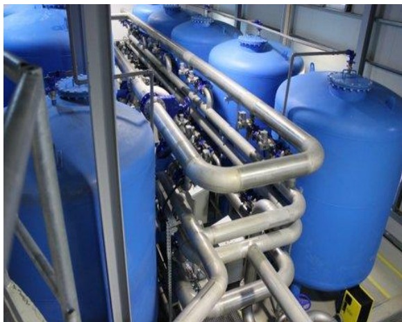
Figure 3. Proposed Treatment Plant - sand filters + GAC filters

Filters GAC: in the filtration process after quick filters with sand were provided three filtration units with granular activated carbon (GAC) under pressure, DN2600mm, made of carbon steel, sized to provide specific speed filtering 9.97 m / h in the case of filtration through the filtration of 3 units and 14.95 m / h when the filter is the filter in the wash. The principle of filtering is similar to that of the sand filters (Figure 3).