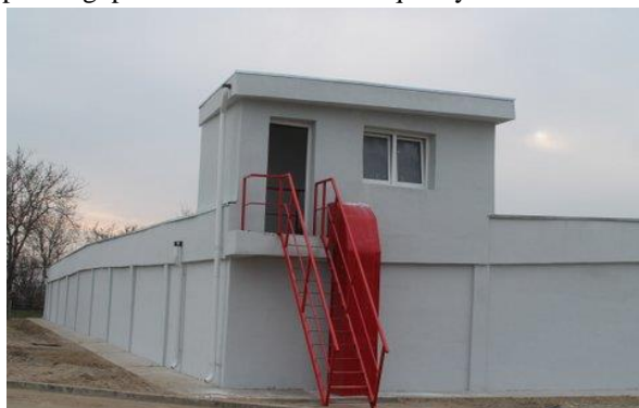
Figure 5. rehabilitated tanks with total capacity of 2500 cubic meters; Pumping station rehabilitated

monitoring, local display and signalling dispatcher operating parameters and water quality as follows: