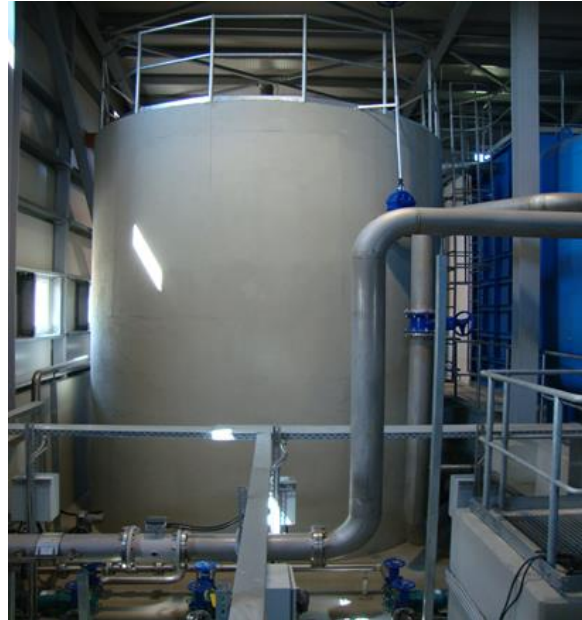
Figure 4. Sequential Decanter for water washing treatment

To ensure the evaporation of water from sludge by convection effect, polycarbonate roof perimeter must ensure a free space to ensure natural ventilation.